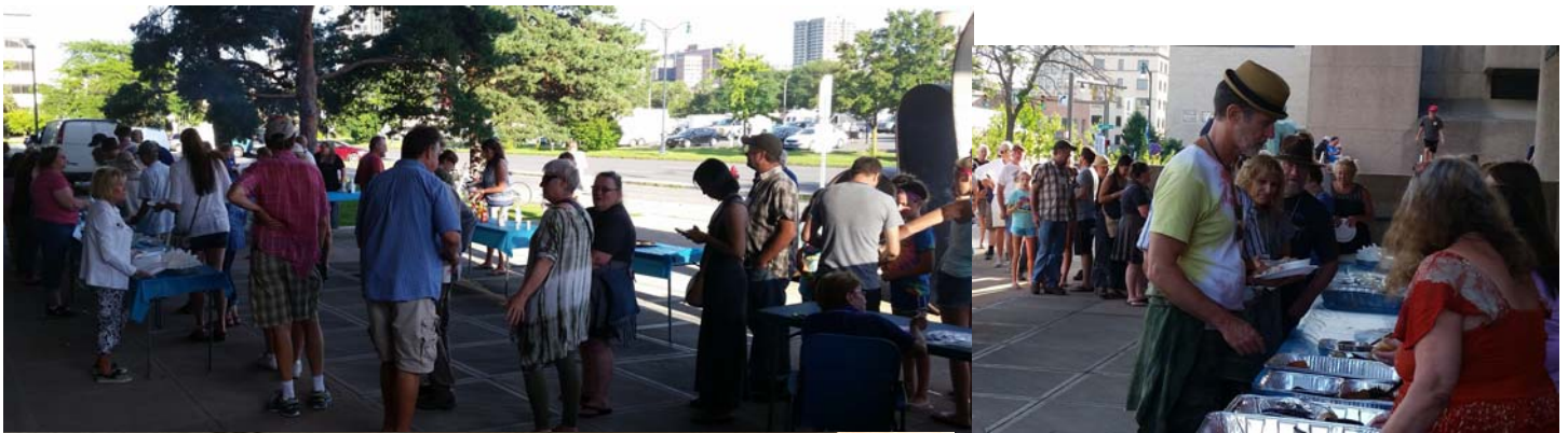
Arts & Crafts BBQ Friday, July 28, 2017