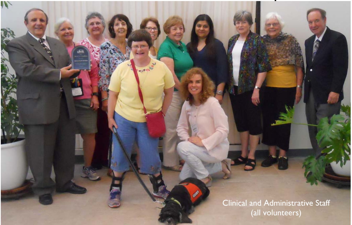
Clinical and Administrative Staff (all volunteers)