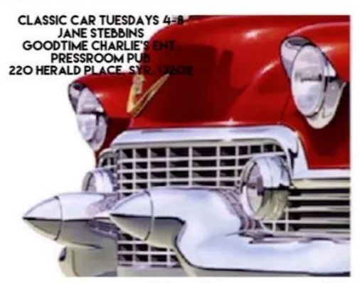
You're not old You're classic